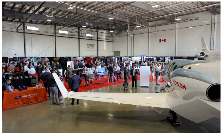
The CBAA 2019 exhibit and static draw crowds.....

What do you get when you combine a Dragon Emeritus, the largest static display of business aircraft in Canada, and the Calgary Stampede? CBAA 2019 of course!